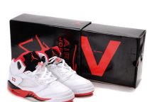
Air Jordan 1 Women high heel black red ID:5558 Free Shipping